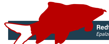
Redtail Shark Epalzeorhynchus bicolor

Native to Thailand, the Redtail Shark had been thought to be completely extinct in the wild until the discovery of a single population was announced in 2014. While some sources claim that collection for the aquarium trade has played a large part, habitat degradation has been the most significant factor in their loss as dams and the draining of wetlands have both changed the waterways where they live. Pollution from agriculture has also been a factor in their demise. However, they have remained to be one of the more common aquarium species due to huge numbers of them being farm raised.